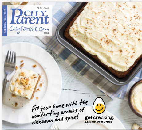
(Above, left): The April front cover of City Parent magazine and (right): EFO's spice cake recipe as a full-page feature.