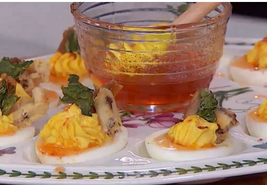
Below: Delicious Chicken and Waffle Devilled Eggs.