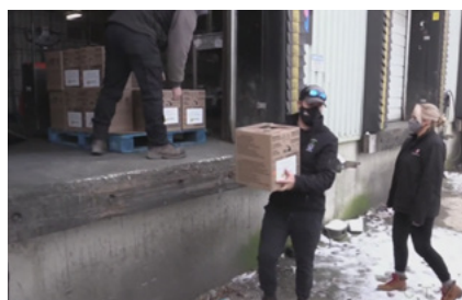
Above: Screen capture of eggs being loaded up for delivery to the Salvation Army.