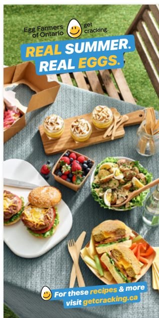
Above: Digital ad created for Foodism. Right: Print ad featured in the July issue of edible magazine.