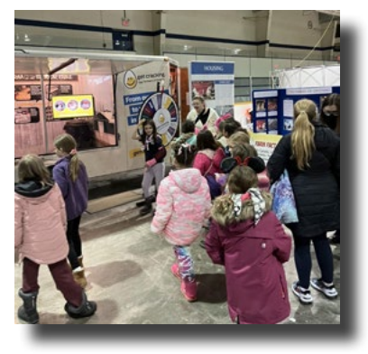
Above: The egg display at Durham Farm Connections.

For more information about the festival, see the Butter Tart Festival News Release included with this issue or visit the festival page here.