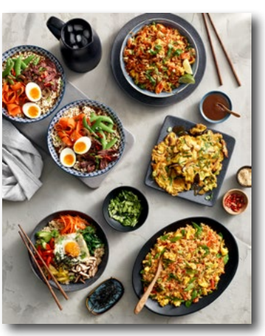
Above: Asian-inspired recipes from EFO's 2023 collection of lifestyle-themed photography.

Left: Elegant egg recipes were featured in House and Home magazine in May.