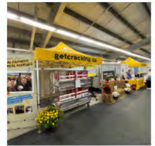
Clockwise, from top left: Breakfast on the Farm , Napanee; CNE visitors at EFO's display; EFO's small trailer at the Western Fair ; and West Niagara Fair .