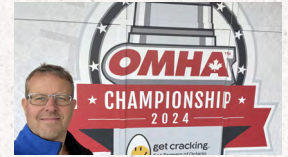
Outreach Update: OMHA Championships