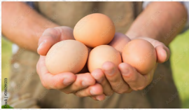
Industry Updates: AAC, FCC, LRIC, OFA, PIC & more