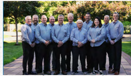
Board Officers, Committees and Representatives