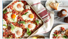
Recipe of the Month: Bruschetta Sheet Pan Eggs