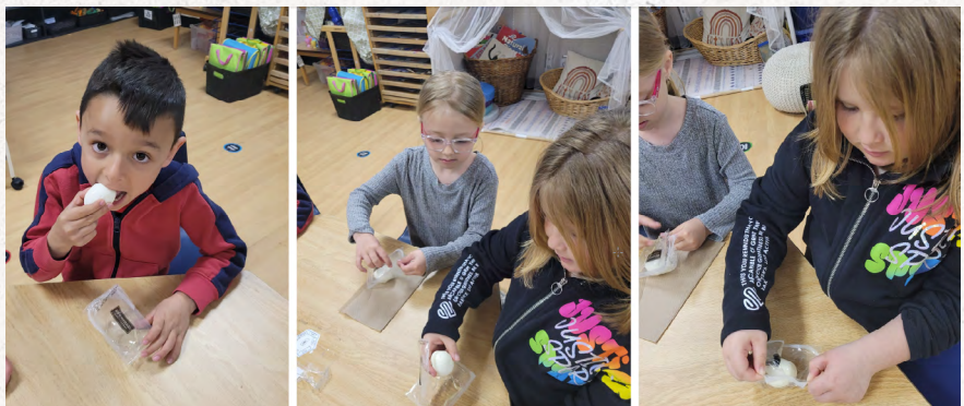
Students enjoy eggs provided to them through the Nutrition for Learning program and Zone 6 egg farmers.

With high-needs schools requiring more support than ever, these egg donations are critical in ensuring that students have access to high-quality eggs and the essential nutrients that help them grow and learn.