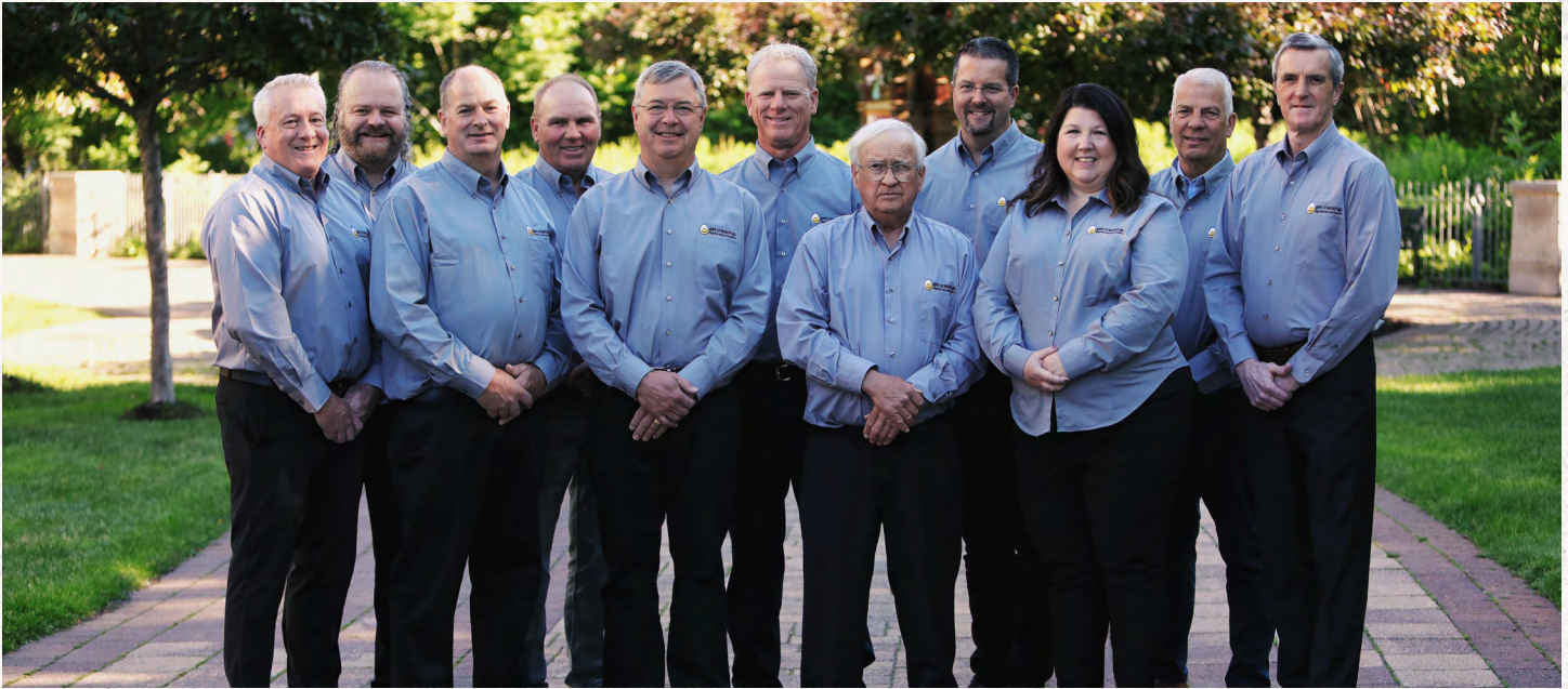
EFO's Board of Directors, 2024-2025