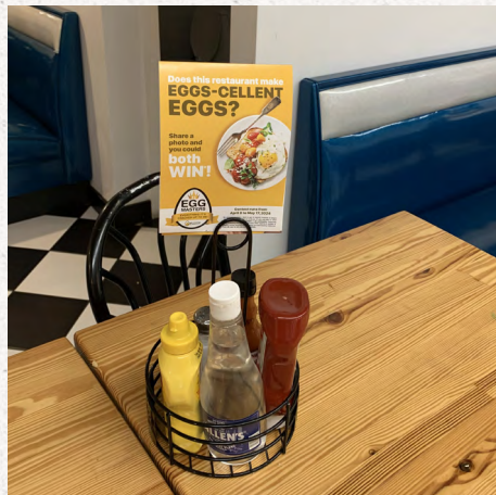
Clockwise, from above: Table card promoting Egg Masters from a participating restaurant; a hearty contest entry on the eggmasters.ca website features Eggs Benedict; and classic sunny side up are a favourite in this review.

Don't forget to check out the entries and find your favourite at eggmasters.ca , but be warned - it will make you crave eggs!